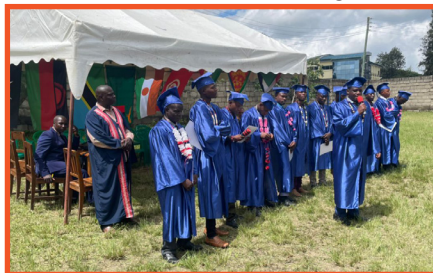
Graduation in Mbeya