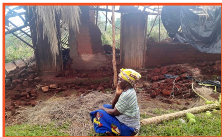
Devastation in Malawi

ation of 13 cross-cultural workers (CCWs) from a six-month training course designed to prepare them to reach unreached people groups in Africa. These 13 students from three different countries (Tanzania, Malawi and Zambia) learned about cross-cultural adaptation, theology, reaching Muslims with the gospel, small business development and management, and leadership skills. Some of the people groups this class of students is targeting are those on the Islands of Pemba and Unguja, the Yao of Malawi and the Wandengereko of Tanzania. Pray for them as they put into practice the skills they have learned through the program John, Jack and others have designed. This program is part of GMI's commitment to reach 20 unreached people groups with the gospel by sending 60 CCWs by the year 2033.