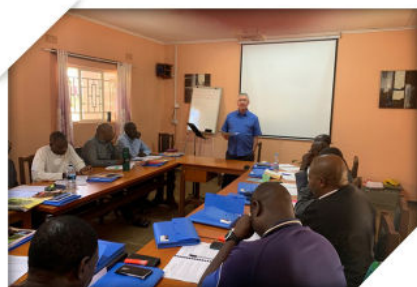
ITT classroom session

education and the practical steps to opening a Bible school in their own country. Both Zimbabwe and Zambia have plans to do so this year!