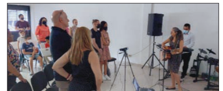
New church service in Panama.

We also were able to visit our GMI team members in Panama in April, working on their new church, buying some needed chairs, and having an encouraging time of being together and serving.