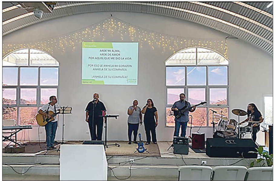
Iglesia Biblica de la Gracia church service in Costa Rica