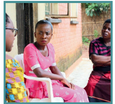
Hlupe following up with women in business training