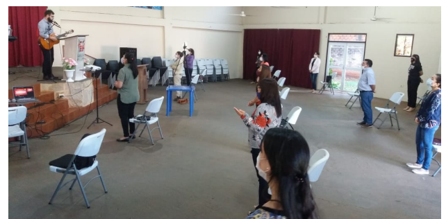
Services during Covid

"May the God of hope fill you with all JOY and PEACE as you trust in him, so that you may overflow with HOPE by the power of the Holy Spirit."