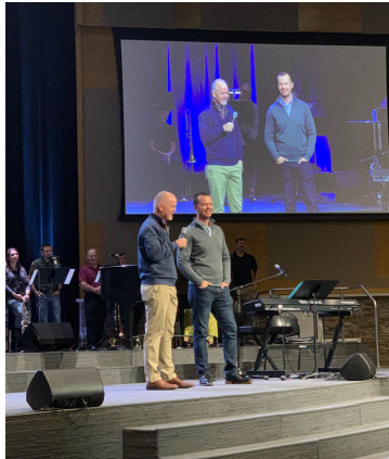
Speaking in churches

Greetings from our family to yours during this holiday season!