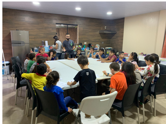
• Saturday Kids Program •