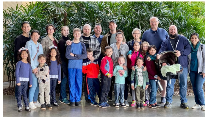
• Team Retreat •