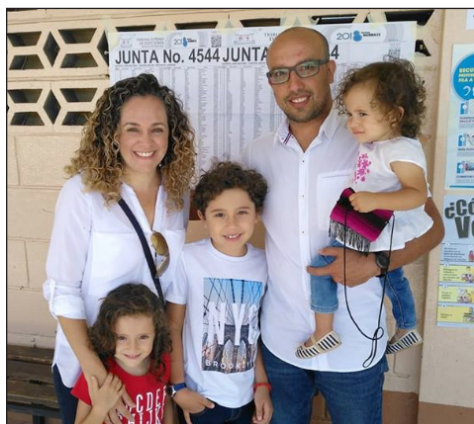
The Barrantes Family

wants us to be. We have had upwards of 25 couples come to these events. Then we just concluded this year's marriage events with a weekend getaway to a hot springs hotel where we had 18 couples dealing again with the goal for marriage from God's viewpoint.