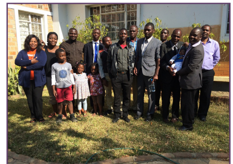
Malawi team in Zambia