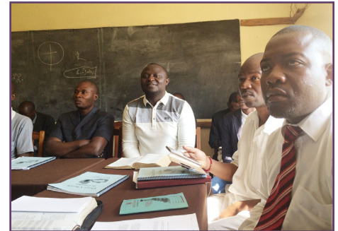
Paying attention at the conference

As we shared with you earlier this year, we continue to give our all to help the Grace Church in Malawi prepare godly and effective leaders who will nurture and lead the churches affiliated with GMI in Malawi to maturity and vitality. In keeping with this goal, our Theology Department has been taking trips outside of Lilongwe to open new Bible Schools in Chichewa as well as making progress on already existing Bible School schools.