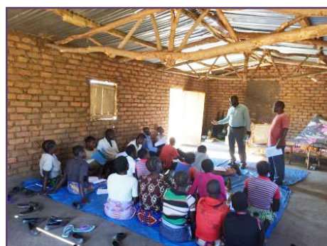
Kanongola class session