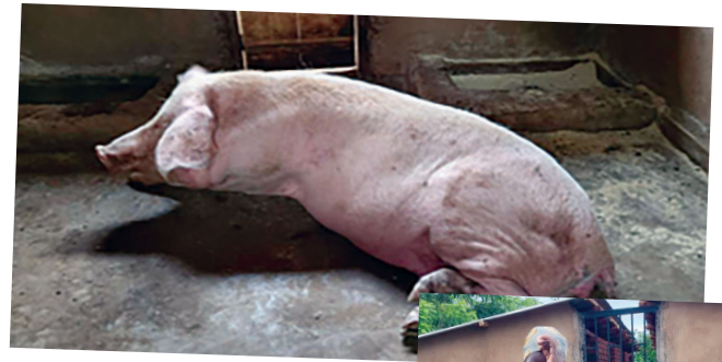
A healthy pig at the farm.

The pigs are growing healthy. Pray that the ladies will be patient and work hard to realize profits.